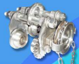
Stainless Steel T/T