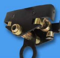
T/T With Flange Guide Rollers